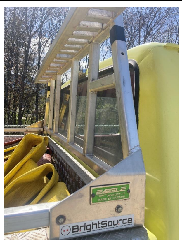
Note: The items shown in the truck box will be removed prior to sale.